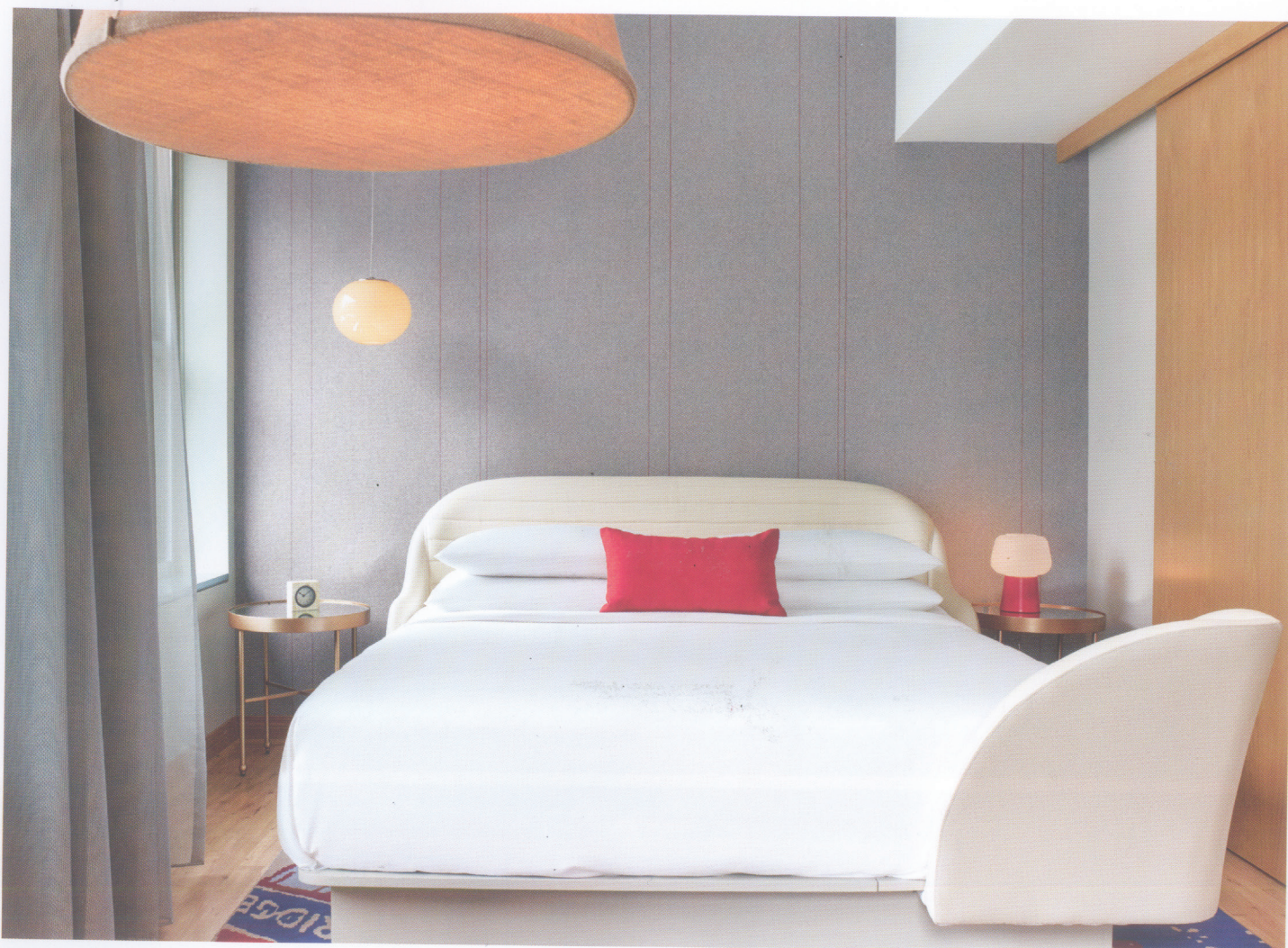
Above: The 210 guestrooms – known as chambers – are designed to a simple palette, punctuated by touches of Virgin red Previous Page: Furniture throughout is by the likes of Poltrona Frau, Poliform, and Knoll, while Vaughan Benz also supplied a number of pieces for Two Zero Three

serene, practical and functional, fun and engaging, and energising and innovative. But we tried to avoid doing it all at once, everywhere.”