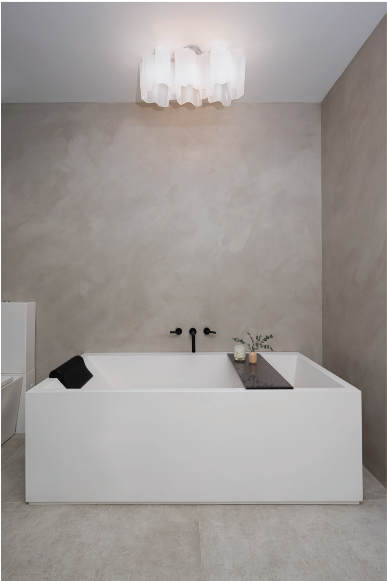
Kartell by Laufen freestanding bathtub