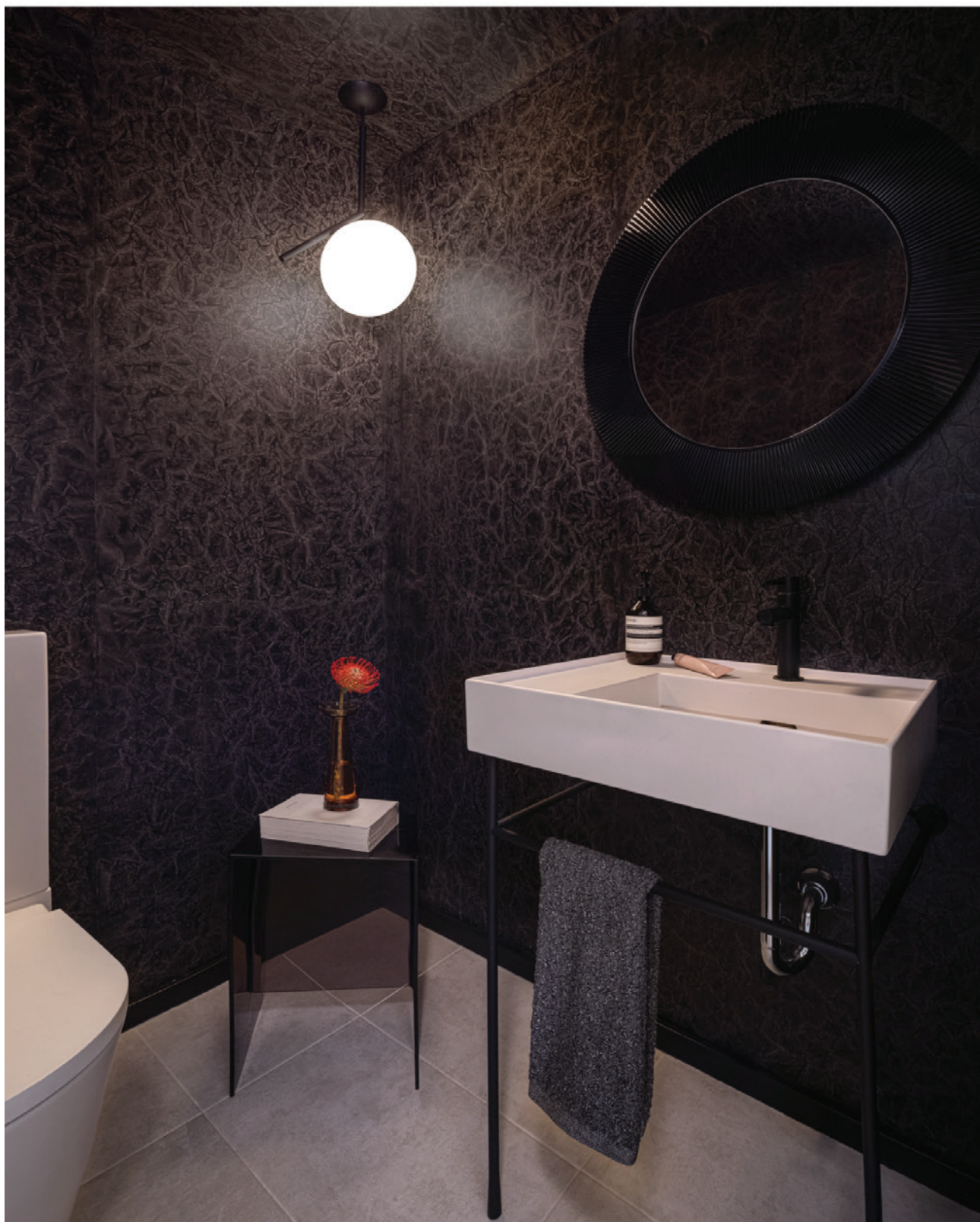
Floorstanding WC, Max Beam stool, washbasin, and All Saints mirror by Kartell by Laufen

personality that could offer some texture. We chose the Logico Triple Linear light from Artemide. We felt like the curvy edges broke up the bathroom's hard lines—and its diffused light and shadows add a touch of drama.