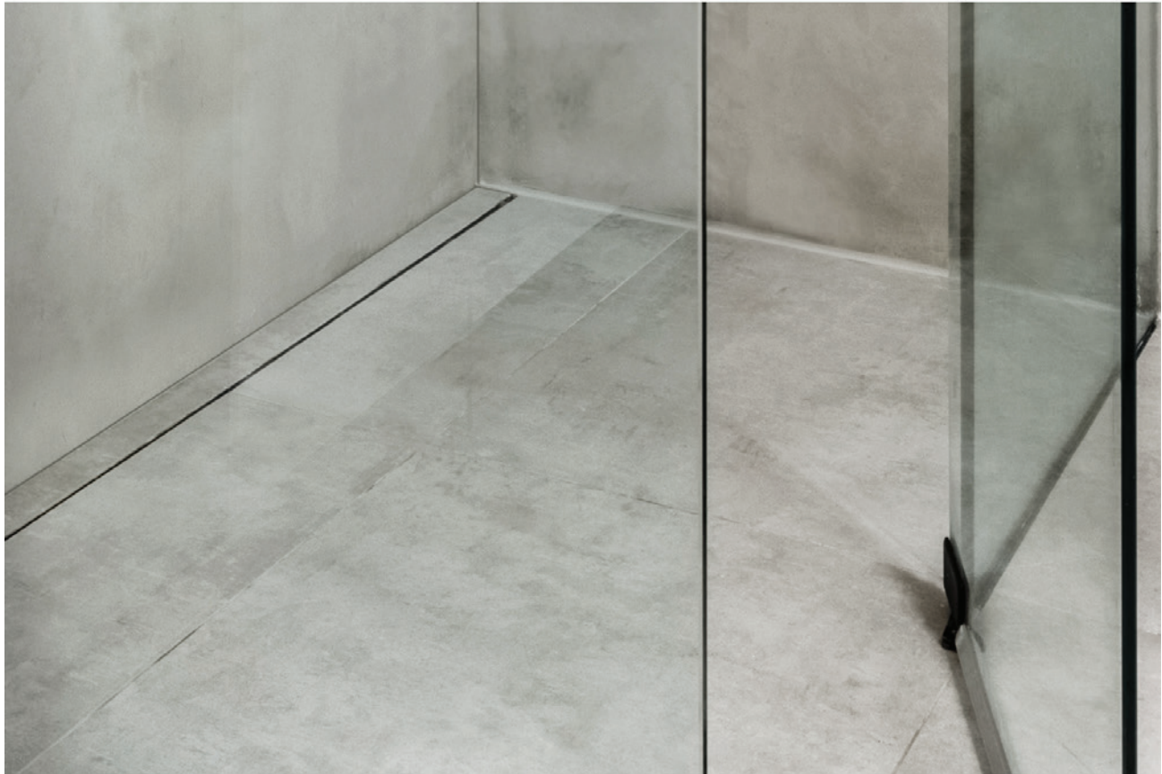
Linear Drain with tile insert frame from Infinity Drain. Tile by Atlas Concorde USA

The linear drain also allowed us great coverage to place a custom radiant heated floor mat down from NuHeat . The heated floor controls are hidden away inside the vanity and easily set by an app on your phone.