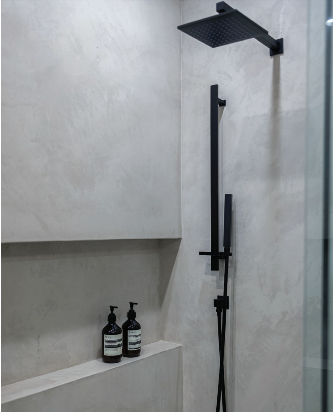
Venetian plaster by Chicago Ornamental Plastering

From a practical standpoint we really wanted a niche in the shower with the cleanest lines possible. We landed on covering the walls and the niche with Venetian plaster. Since it's completely waterproof we were able to wrap everything in it with no seams. It also provided a waterproof backdrop for our wall-mounted trim.