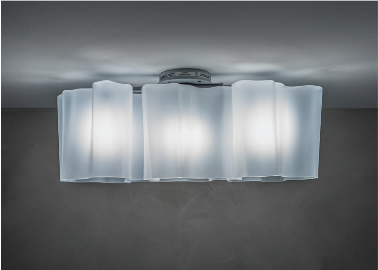
Logico Triple Linear Semi-Flushmount Light by Gerhard Reichert, Michele De Lucchi from Artemide sourced from YLighting.com

To make sure the surfaces came out right we turned to the experts at Chicago Ornamental Plastering. The fourth-generation plastering contractor can make pretty much anything. We showed them one of the Cove Collection tiles and told them to color-match and add some hand-finished details. After a few samples they showed us what they had in mind, then spent several days applying meticulous layers by hand to the bathroom. We were thrilled with the outcome; it adds a beautiful finish to the room.