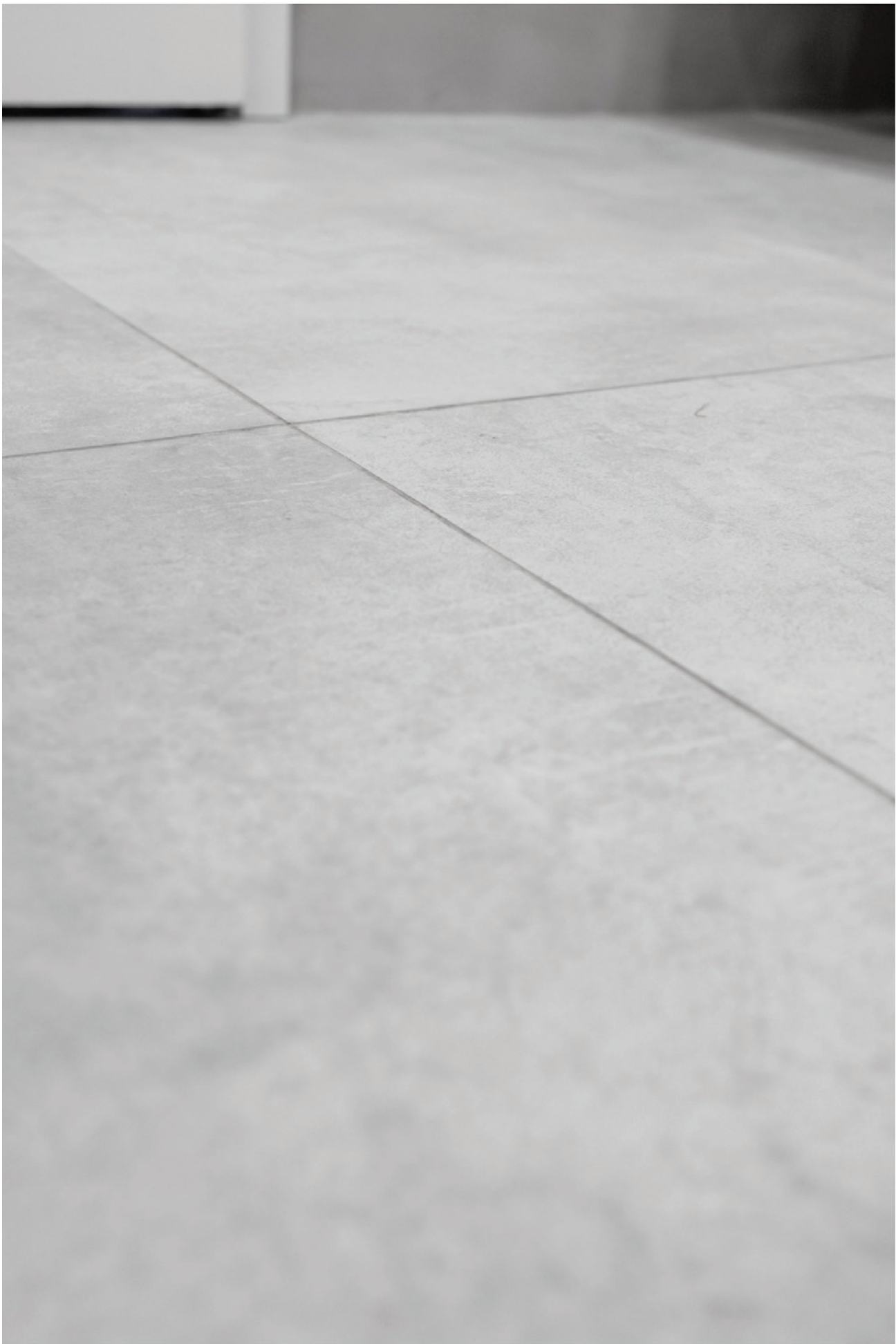
Cove Collection in Linen by Atlas Concorde USA