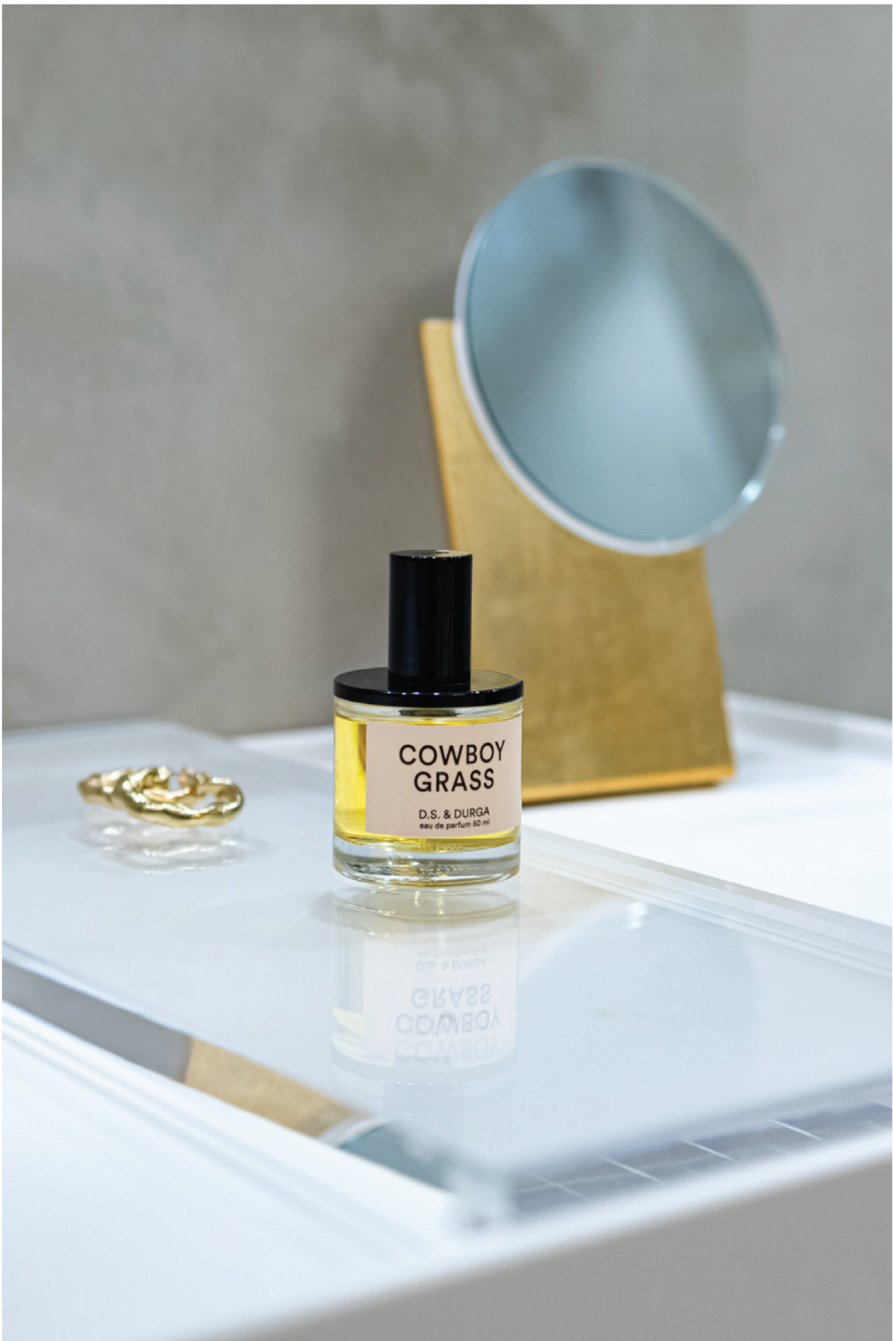
Washbasin shelf by Kartell by Laufen