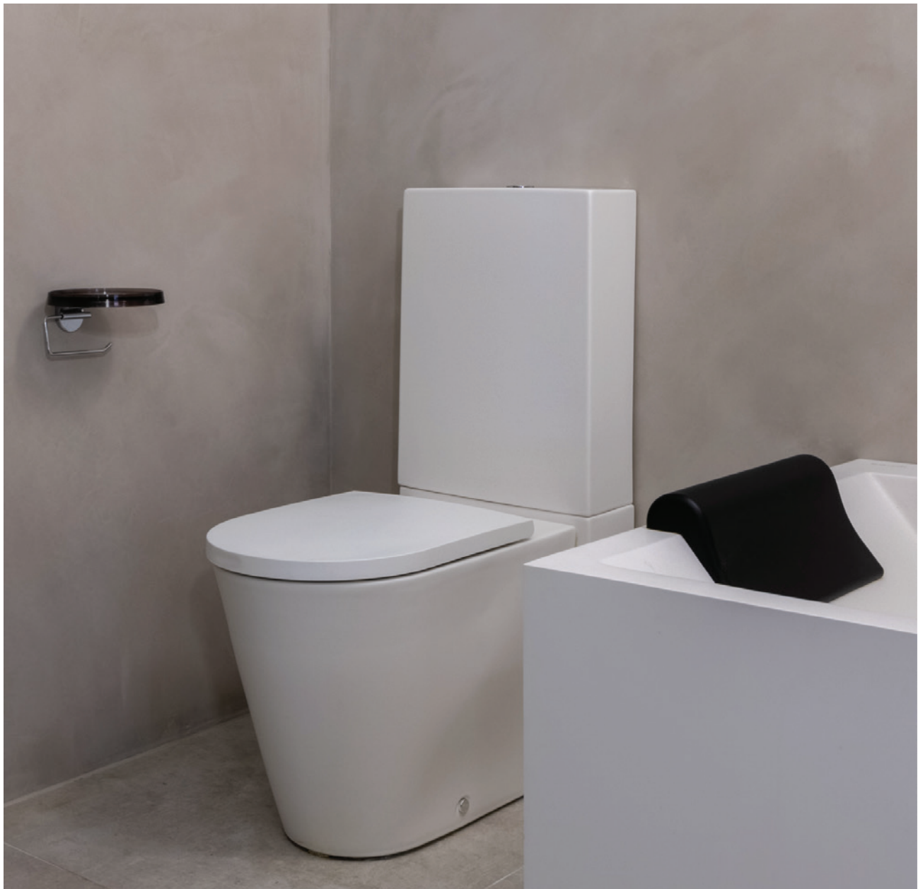
Kartell by Laufen floorstanding WC

I needed a complete loft bathroom renovation. I needed something modern yet peaceful and functional at the same time. But where to begin?