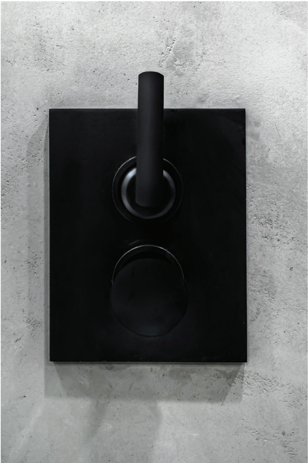
Brut 64 collection by Watermark Designs