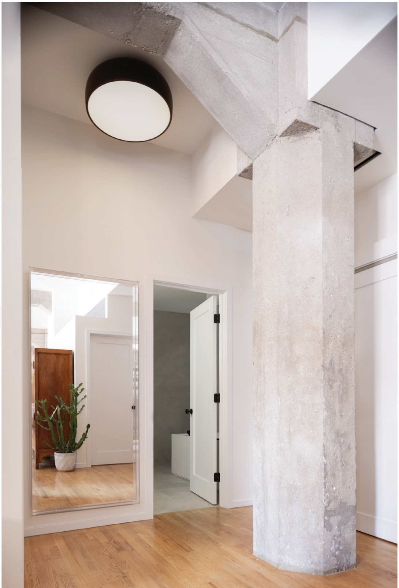
Only Me Mirror in Crystal by Philippe Starck for Kartell. Smithfield ceiling light by Jasper Morrison for FLOS sourced from YLighting.com