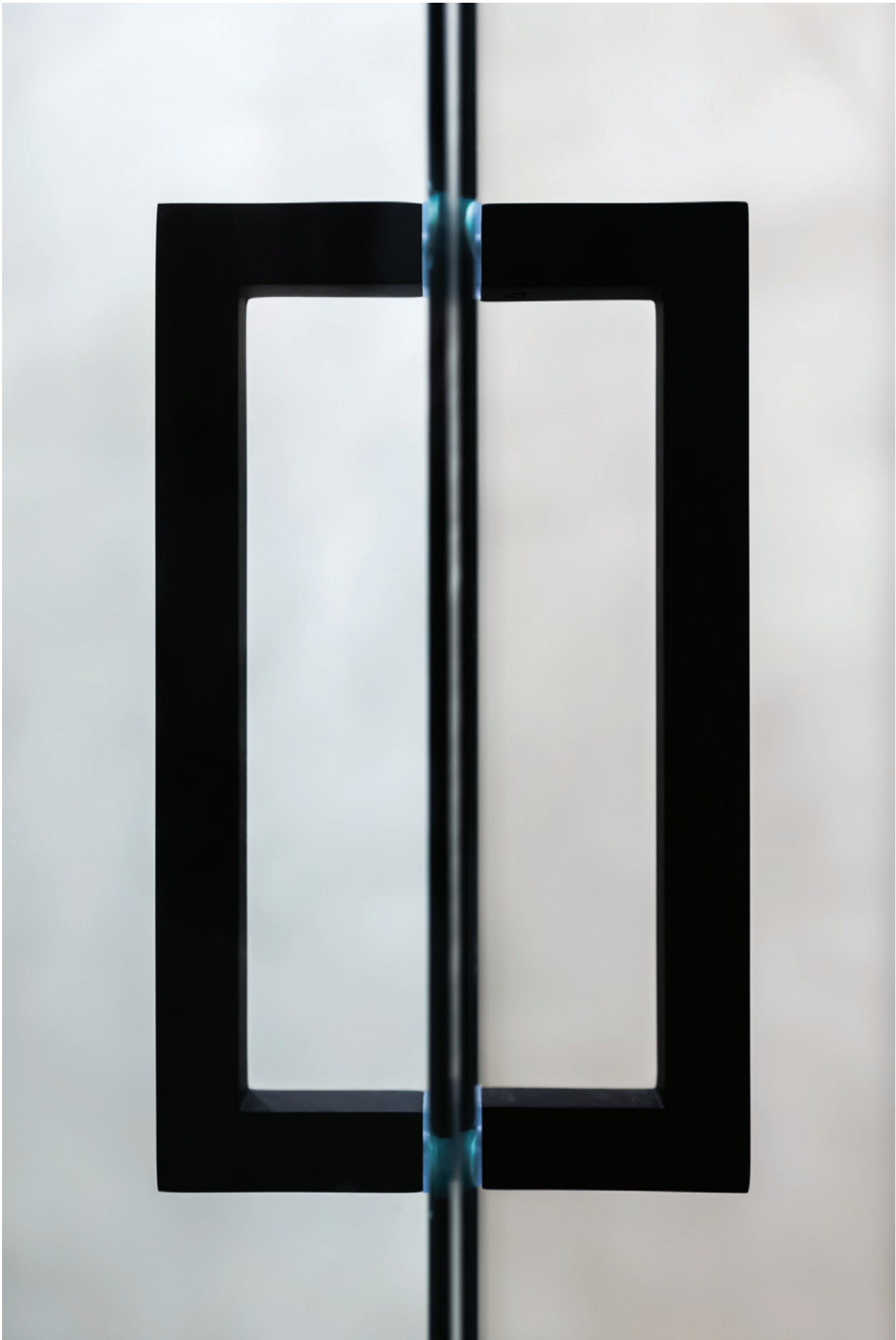
Custom matte black shower handles by Basco