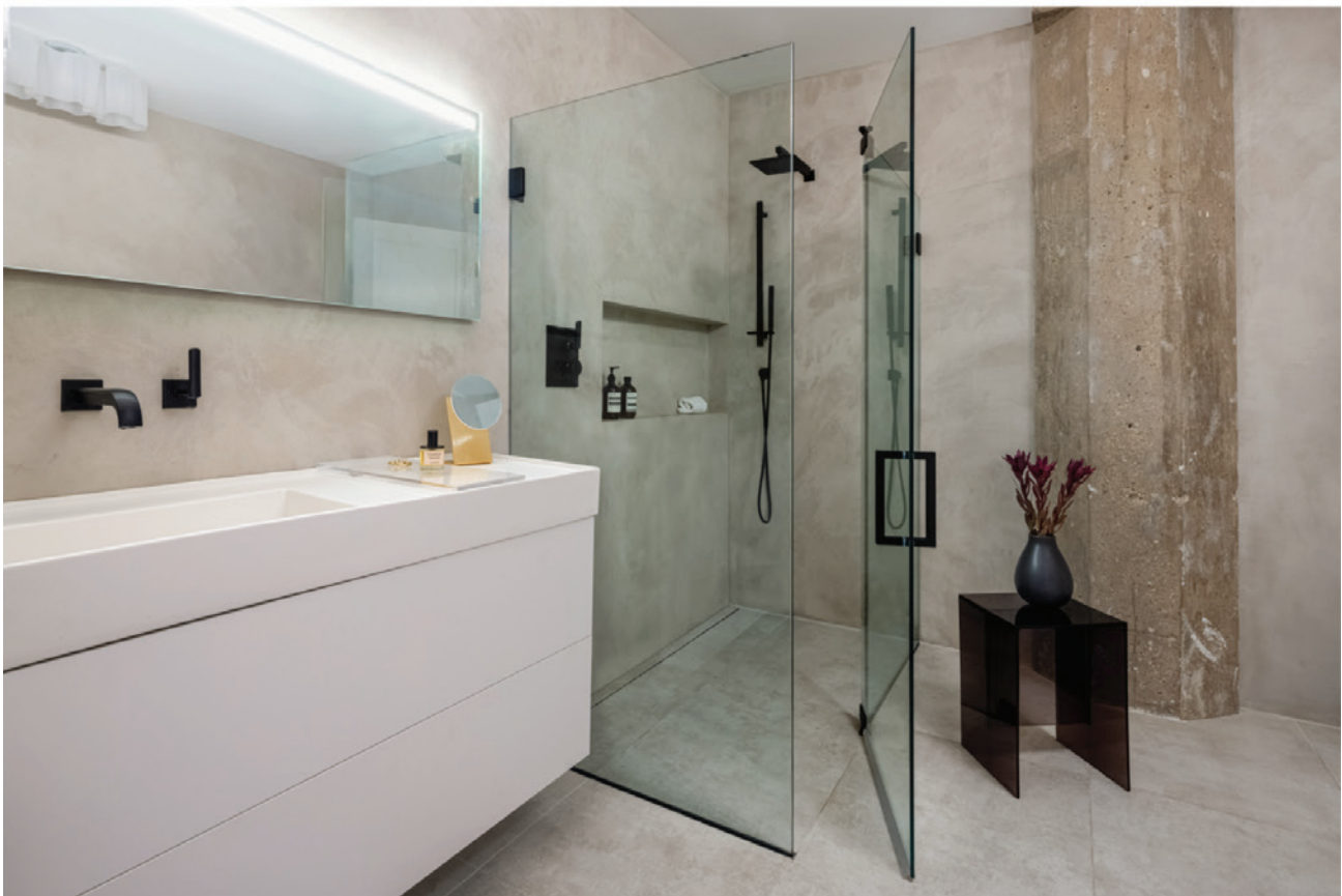
Custom glass shower enclosure by Basco

We found the perfect tile with the Cove Collection from Atlas Concorde USA . They describe the tile as “urban character mixed with handcrafted beauty,” and that matched exactly with what we wanted.