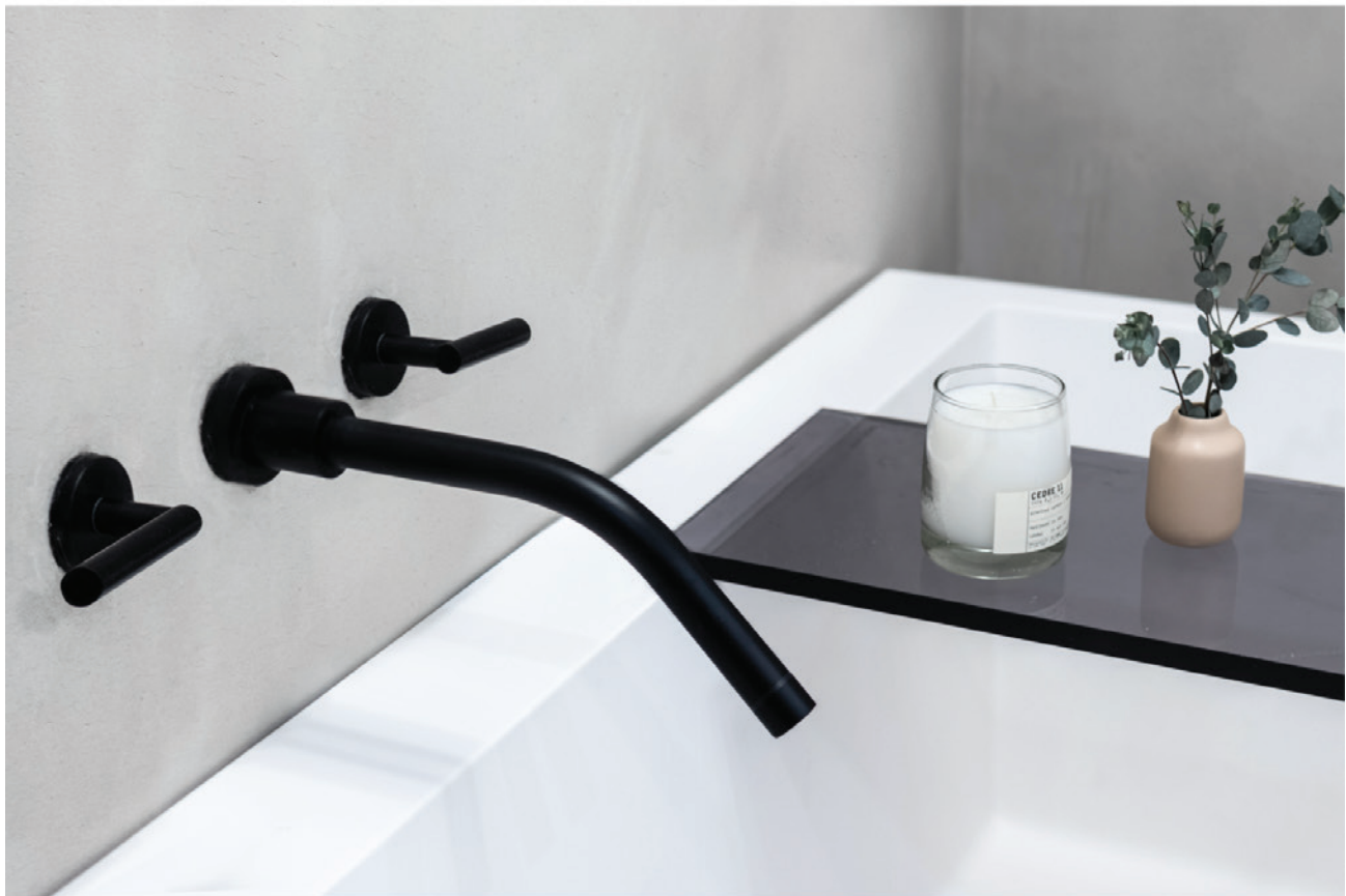
Loft 2.0 Collection by Watermark Designs: wall mounted bath spout and trim

In other words, it's a secret Swiss blend. There's nothing else quite like it.