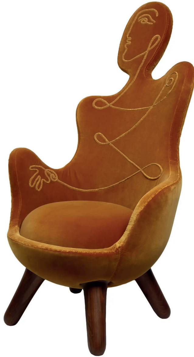
Designer and decorator Vincent Darré pulled from the aesthetics of Surrealism for the Circée Conversation Armchair.

Yet another fashion expatriate who landed in interior and furniture design, the irrepressible Vincent Darré of Paris created a Surrealism-infused seating group called the Conversation Collection. The forms are inspired by Cecil Beaton's portraits of Salvador and Gala Dalí. Available through the Invisible Collection; from $5,310. theinvisiblecollection.com