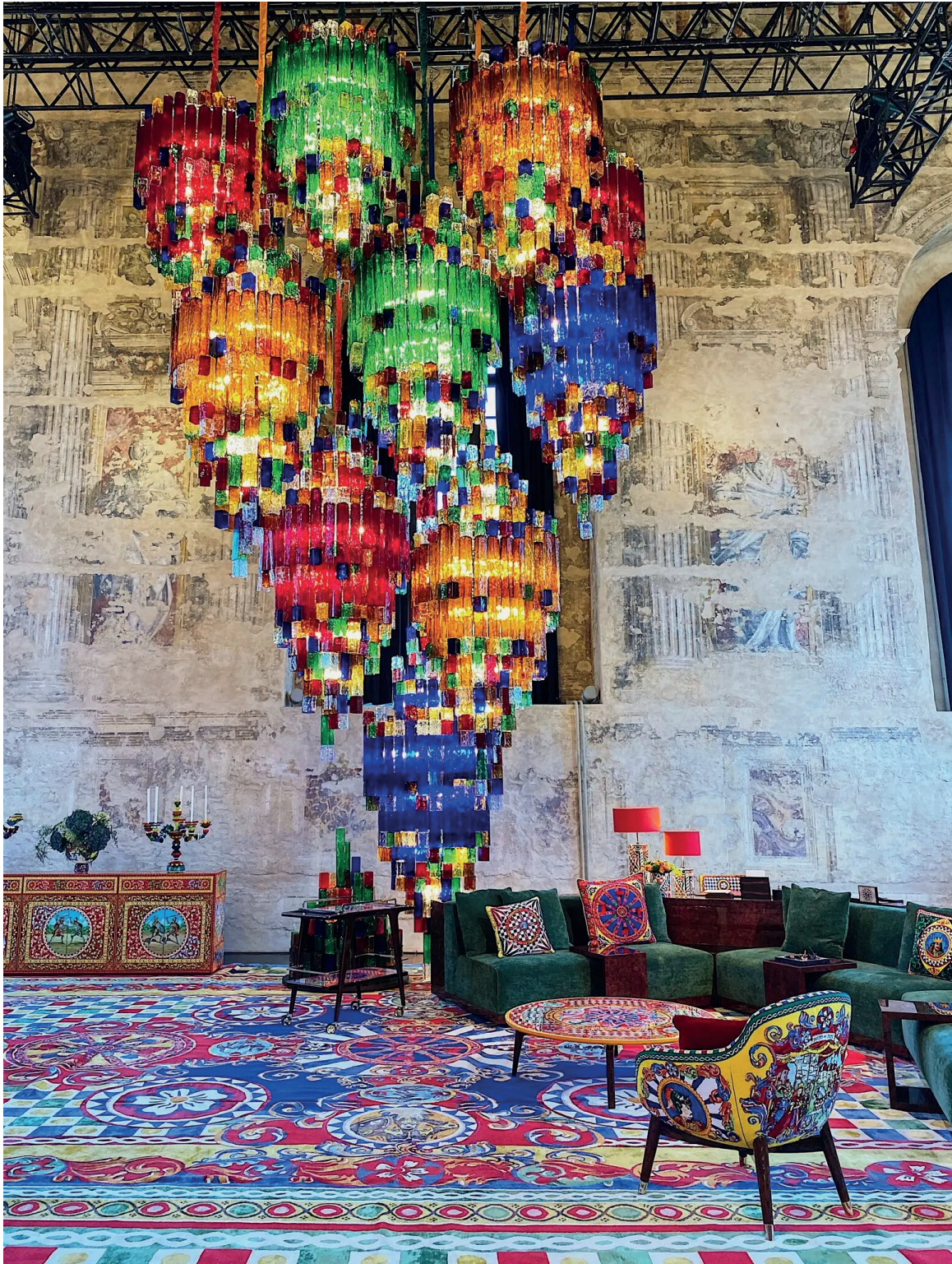
Dolce & Gabbana Casa's Carretto chandelier for Barovier and Toso, displayed at the Scuola Grande della Misericordia in Venice.

For the Venice launch of Dolce & Gabbana's Casa furniture line in 2021, the 700-year-old glass company Barovier & Toso created and hung sensational chandeliers that derived from the collection's themes. Carretto (shown), named for brightly colored horse- or donkey-drawn carts in Sicily, drip with clusters of glass pieces in red, green, blue, caramel and amber. Chandeliers are made to order; individual pendants start at $175,300 (converted from 175,000 euros). us.dolcegabbana.com