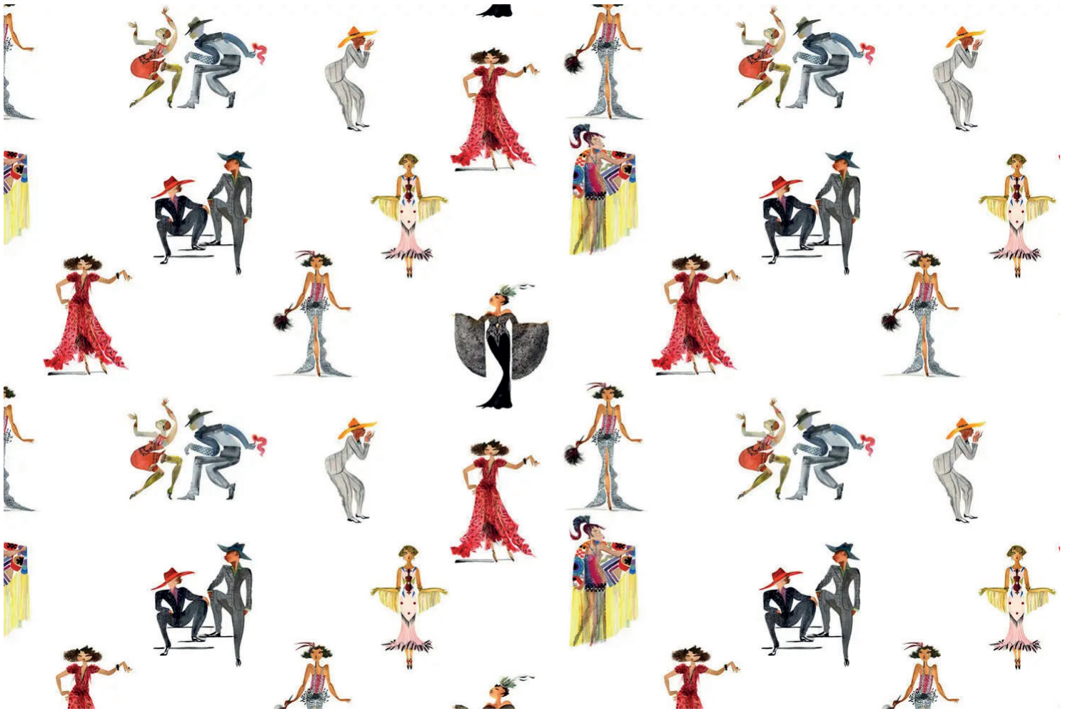
Wallpaper comprising sketches that depict the costume design behind "After Midnight."