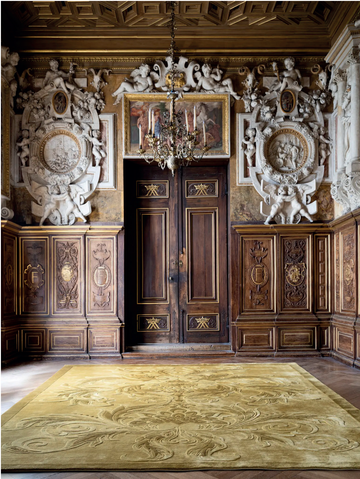
Dolce & Gabbana Casa's Carretto chandelier for Barovier and Toso, displayed at the Scuola Grande della Misericordia in Venice.

For the Venice launch of Dolce & Gabbana's Casa furniture line in 2021, the 700-year-old glass company Barovier & Toso created and hung sensational chandeliers that derived from the collection's themes. Carretto (shown), named for brightly colored horse- or donkey-drawn carts in Sicily, drip with clusters of glass pieces in red, green, blue, caramel and amber. Chandeliers are made to order; individual pendants start at $175,300 (converted from 175,000 euros). us.dolcegabbana.com