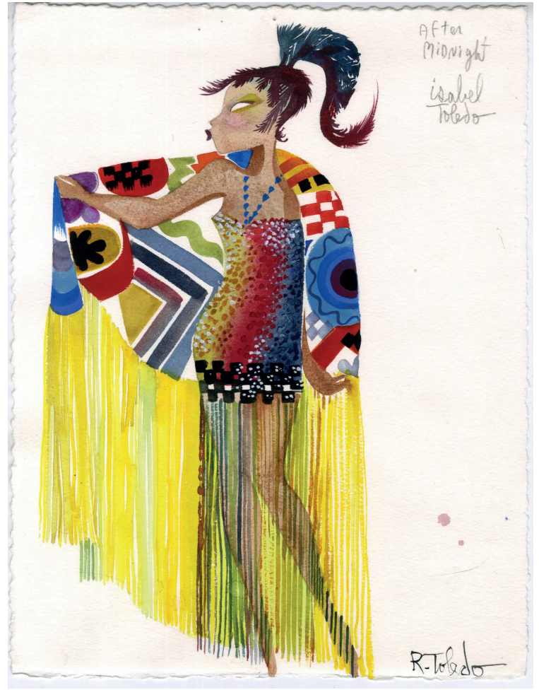
The production pays homage to the Jazz Age and Langston Hughes.