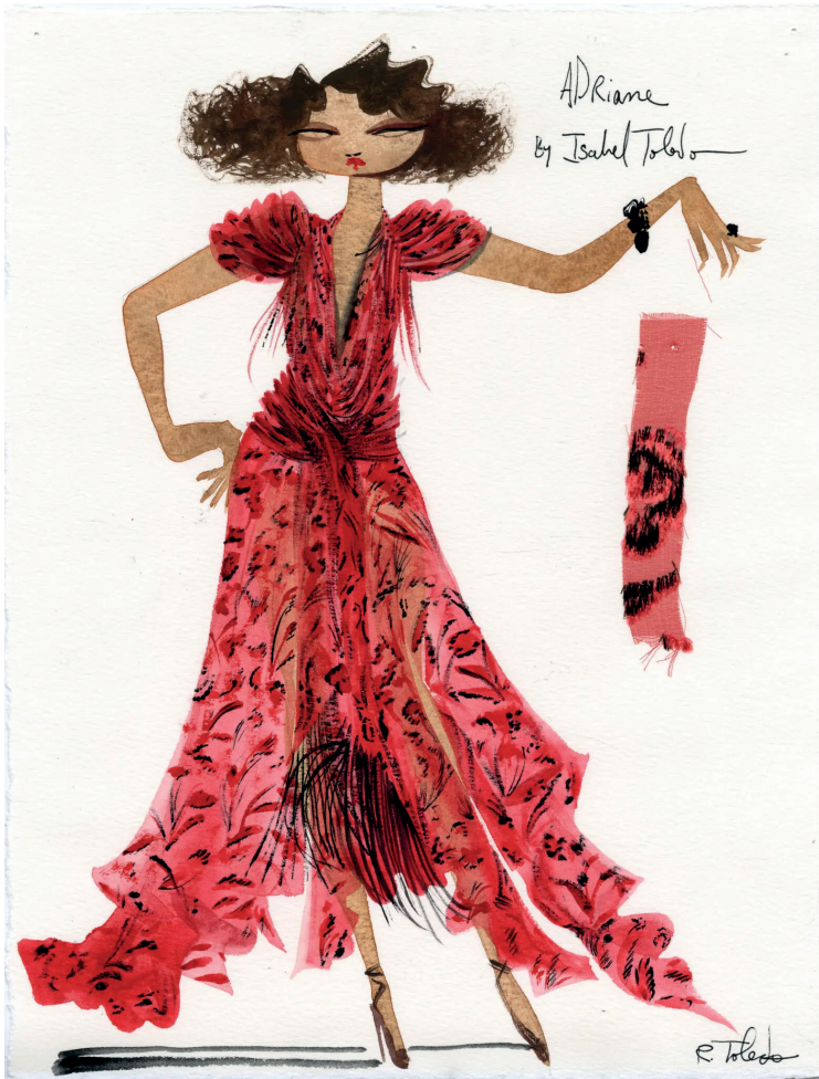
Ruben Toledo's sketch of an Isabel Toledo design for a character in "After Midnight."