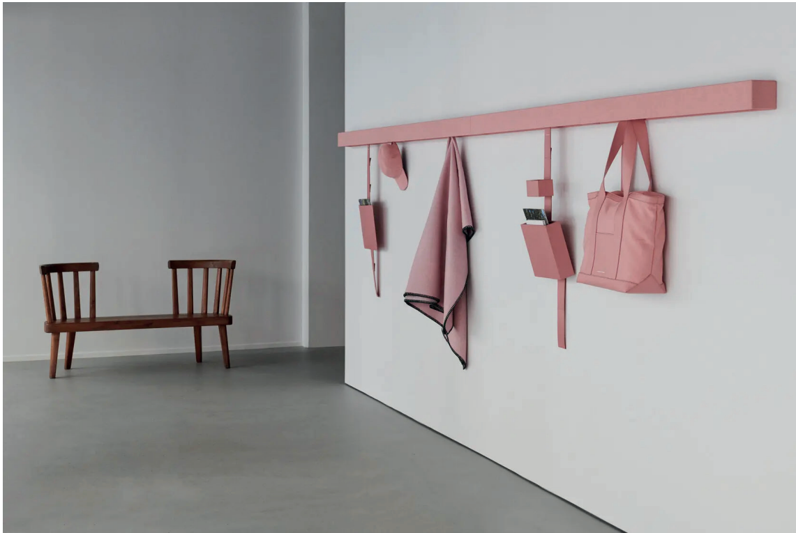
Raf Simons, the co-creative director of Prada, designed the Shaker System, a minimalist storage bar that playfully unifies accompanying accessories, for Danish company Kvadrat.

When you ask Raf Simons, the co-creative director of Prada, why he abandoned his intended career as a furniture designer for fashion, he has two words to say: “Martin Margiela” (referring to the avant-garde couturier and fellow Belgian). But when Mr. Simons returned to his furnishing roots recently to create a Shaker-inspired storage system that mounts on a wall, it hardly seemed like a step away.