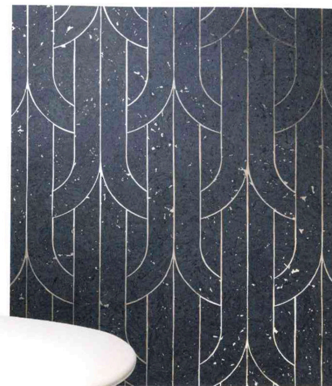
David Rockwell x Maya Romanoff wall covering, March/April 2023 Maya Romanoff, D&D, 979 Third Ave., Ste. 922, NYC, 212-588-9707, mayaromanoff.com