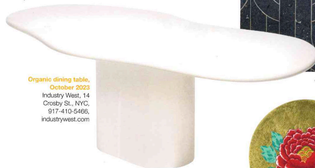
Organic dining table, October 2023 Industry West, 14 Crosby St., NYC, 917-410-5466, industrywest.com