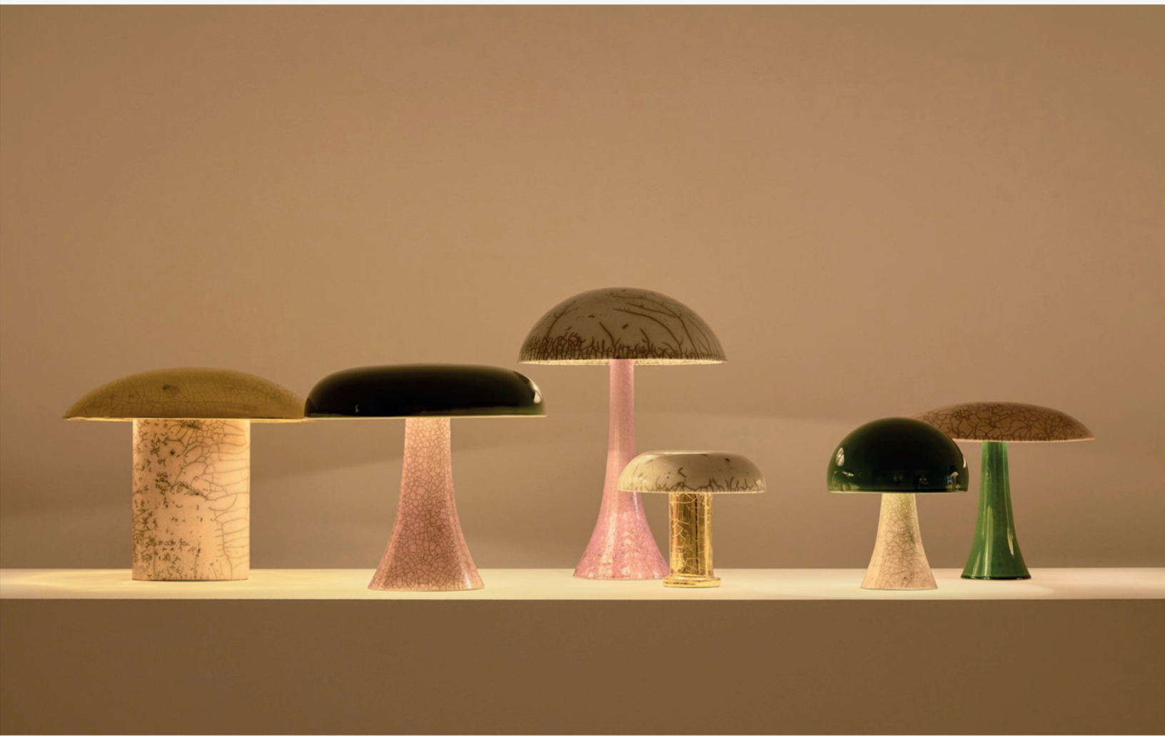
Jos Devriendt's ceramic lamps at Demisch Danant.