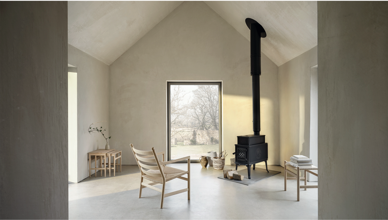
The CH004 Nesting Tables from the archives of Hans J. Wegner.