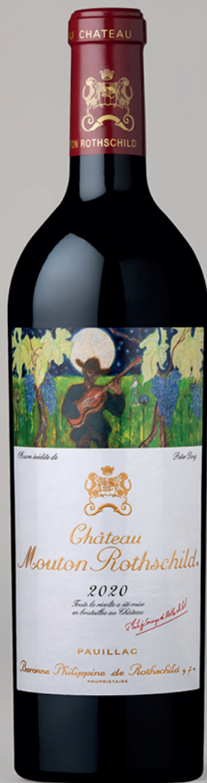
Peter Doig x Château Mouton Rothschild