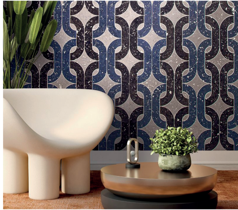
David Rockwell Porto Elo wall covering for Maya Romanoff.