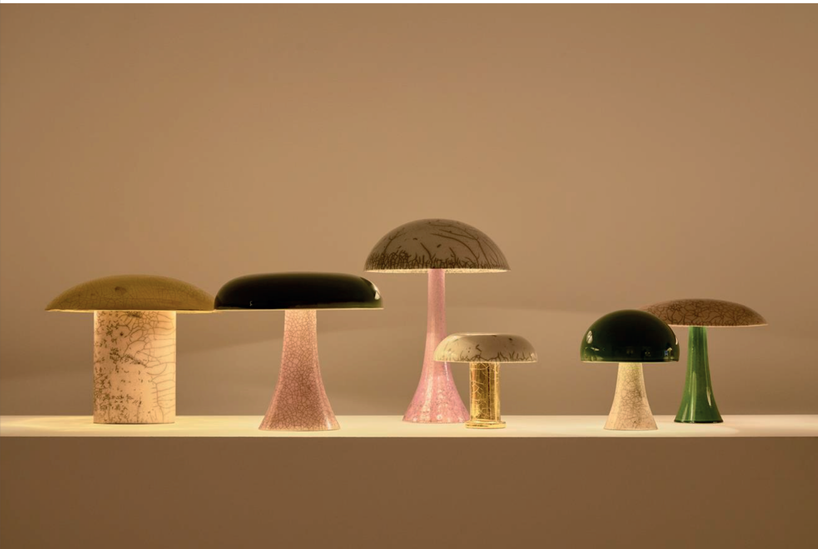
Jos Devriendt's ceramic lamps at Demisch Danant.