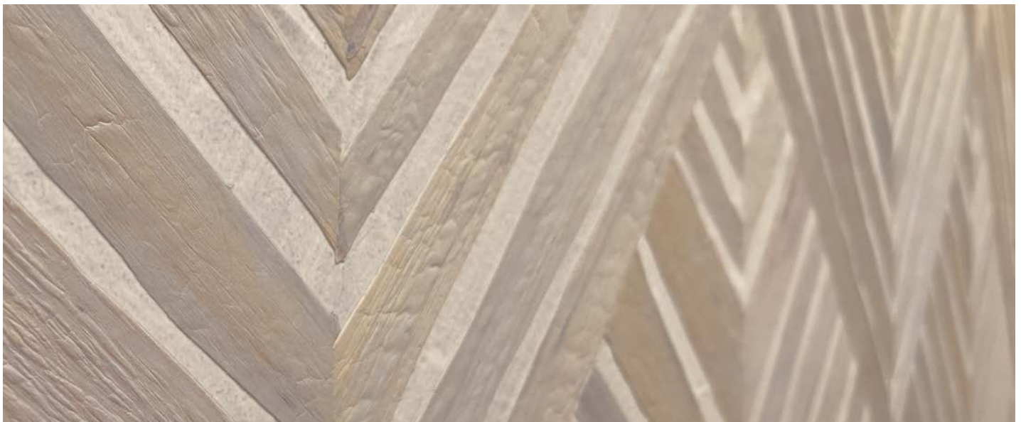
Meet the brand's latest launch, Water Hyacinth Parquet.

Maya Romanoff knows this well. For more than 50 years, the award-winning brand has been the largest producer of handcrafted wallcoverings in the United States. Finding beauty in the natural world, the family-owned and -operated company uses sustainable materials in unexpected ways to create extraordinary products, many of which are locally produced in their 40,000-square-foot state-of-the-art studio in Skokie, IL. Maya Romanoff is set to open their new Chicago flagship showroom under the same roof in late October. Now, they are sharing 13 surprising materials you can embrace to make your walls pop.