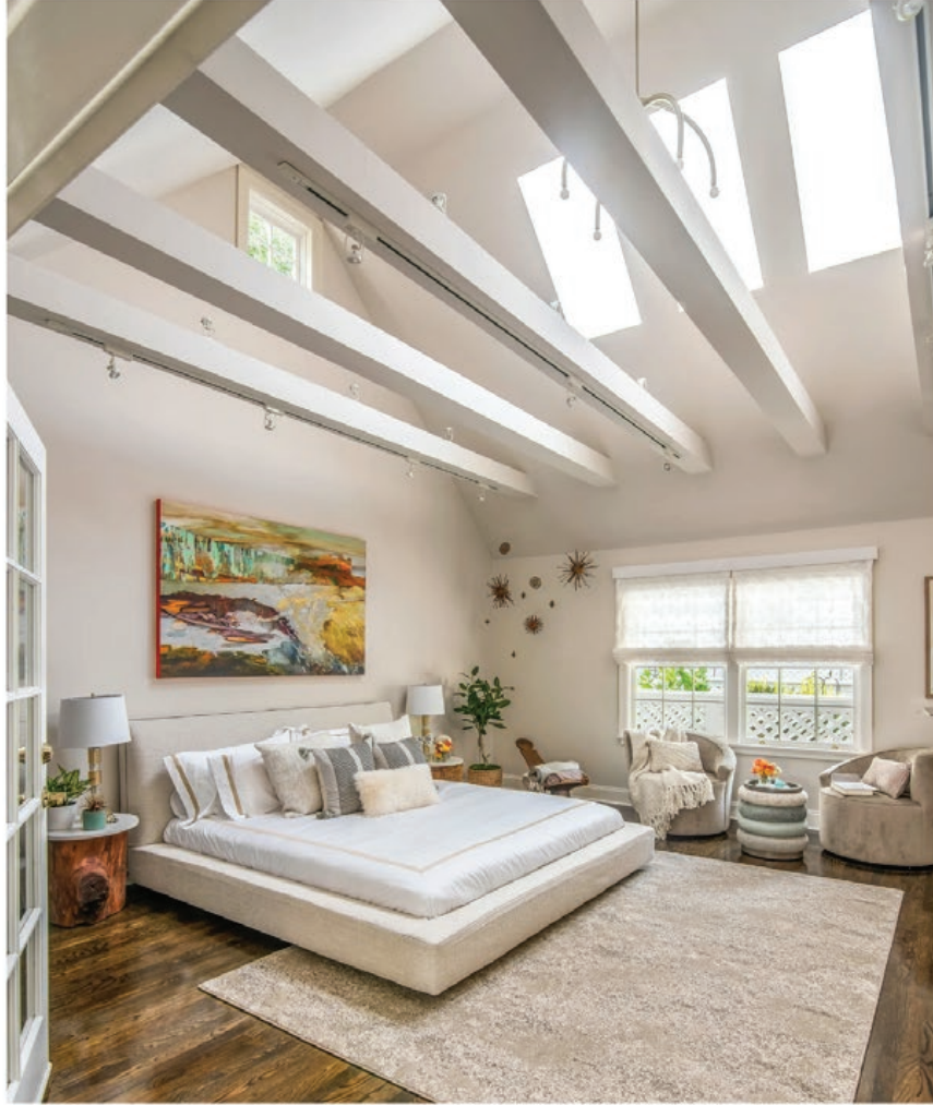
Guesthouse bedroom by Goli Karima and ASID Pasadena Chapter Student Members

In the guesthouse, dubbed “the garden retreat,” designer Maria Videla-Juniel employs Thibaut’s Aerial View wallpaper because it “is reminiscent of the formal gardens of the property, with classical balustrades and very geometric shapes in neutral colors.” Wood accents and natural materials juxtapose with neutral components to feel “crisp and relaxing at the same time.” Original artwork is from Fresh Paint Art Advisors.