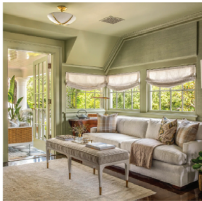
Primary suite by Courtney Thomas Design