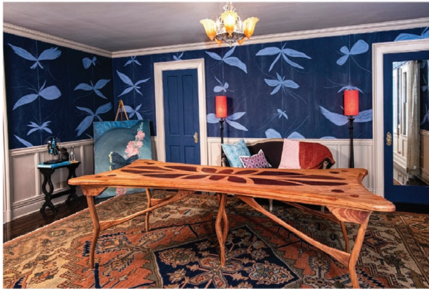
Artist's Wunderkammer by Rosemary Home Design