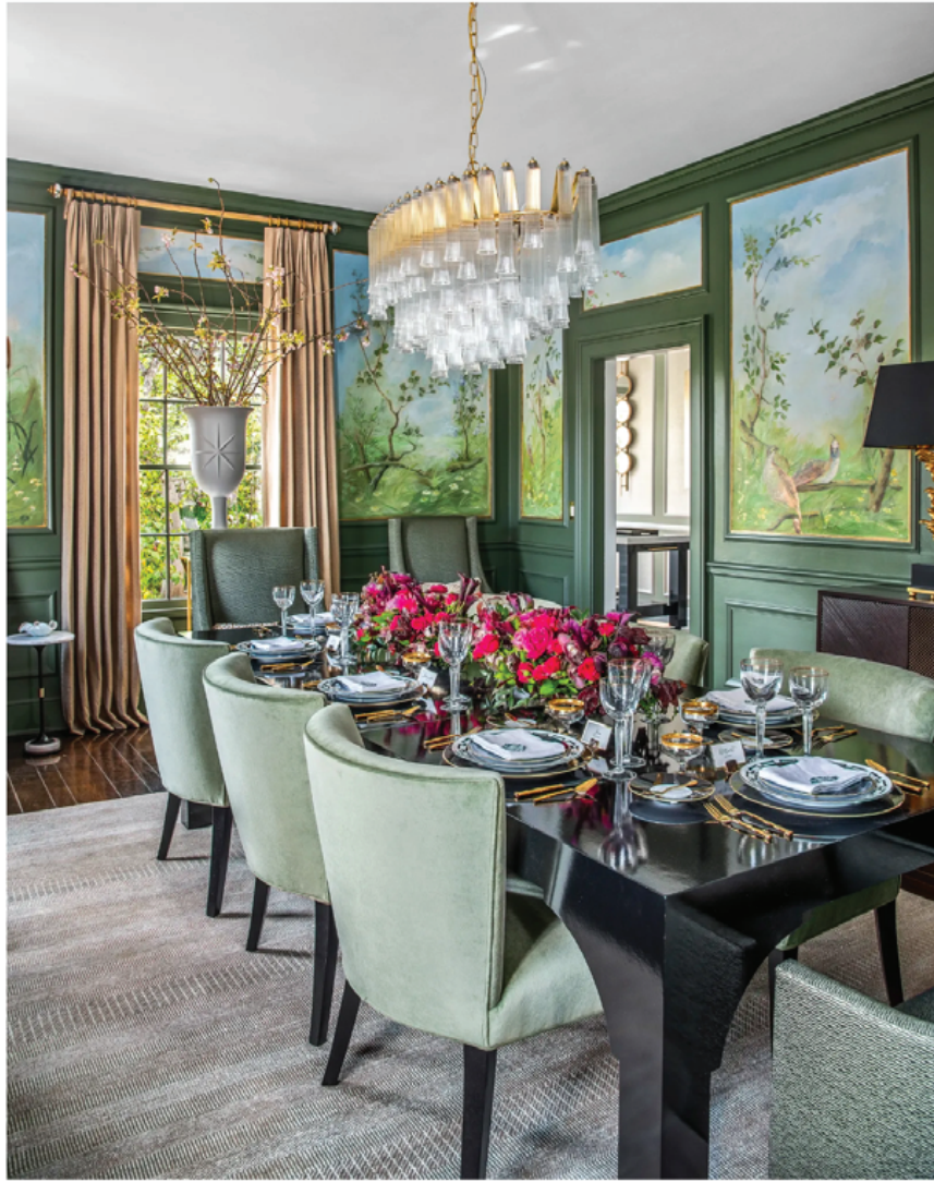
Dining room by Rachel Duarte Design Studio