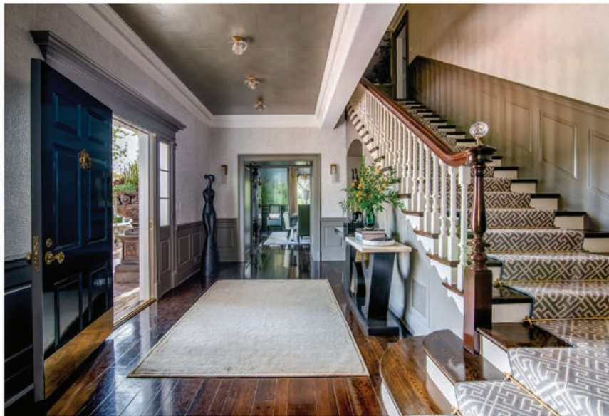
Foyer by Marbé Designs

A stately approach to greenery—iceberg roses, boxwood globes, and needlepoint ivy included—emphasize the Stewart House's distinguished facade and projecting Colonial portico.