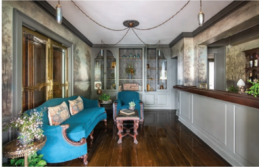
Speakeasy by Sukeena Homes