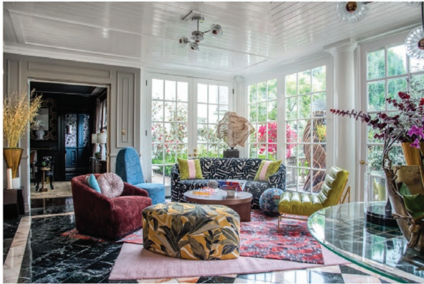
Garden room by R/terior Designs