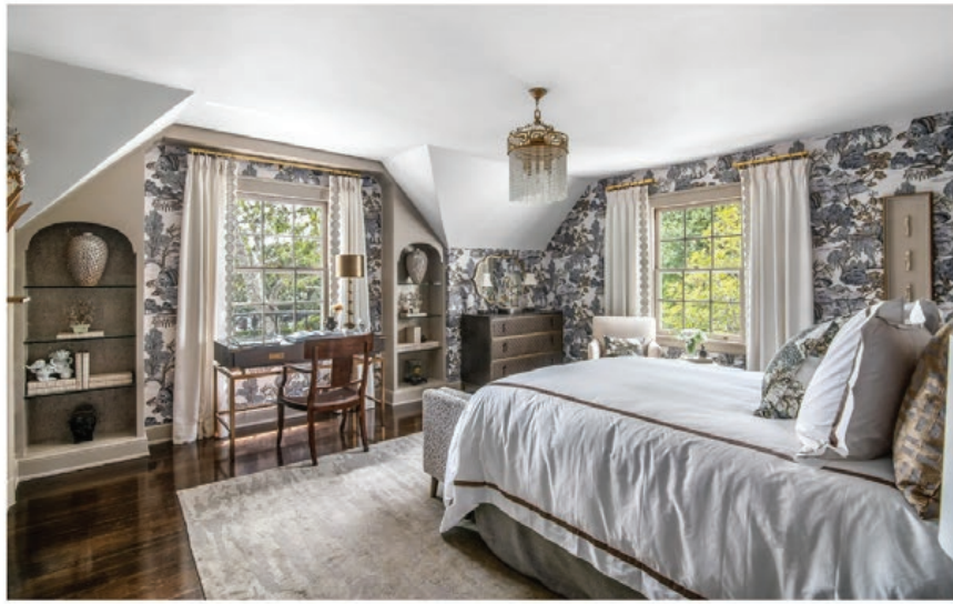
Guest bedroom by Tocco Finale