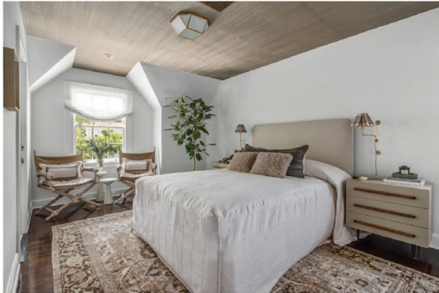
Bedroom by Loue Interiors

For the light and breezy upstairs lanai terrace with a loosely tropical vibe, designer Meredith Green imagined “if Daisy Buchanan’s porch were in the Caribbean.” Capital Lighting’s Cecilia fixtures and a dramatic Banana Leaf chandelier by Varaluz (both from Ferguson) illuminate the outdoor seating, including the fanlike rattan lounge chairs.