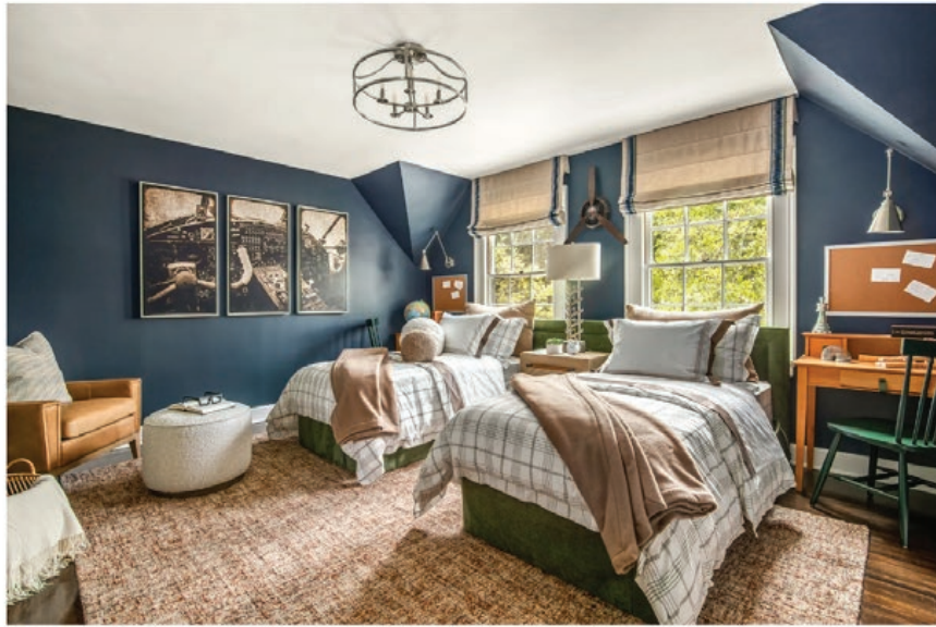
Bedroom by Ashley Marie Design