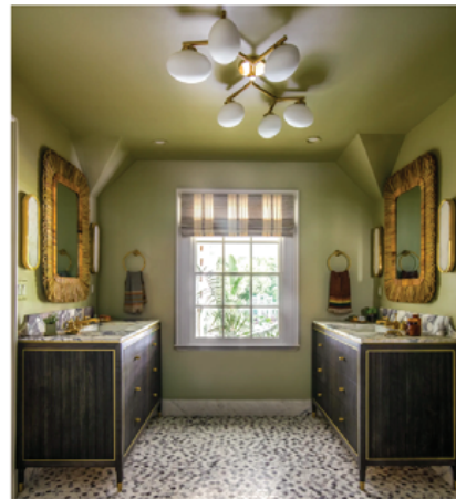
Primary bath by Courtney Thomas Design