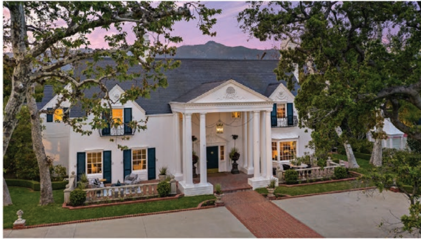
Welcome garden by Greenlink Landscaping

Tour the Pasadena Showcase House of Design 2023's most inspiring interiors below.