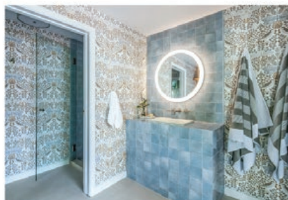
Pool cabana dressing room by the Studio For