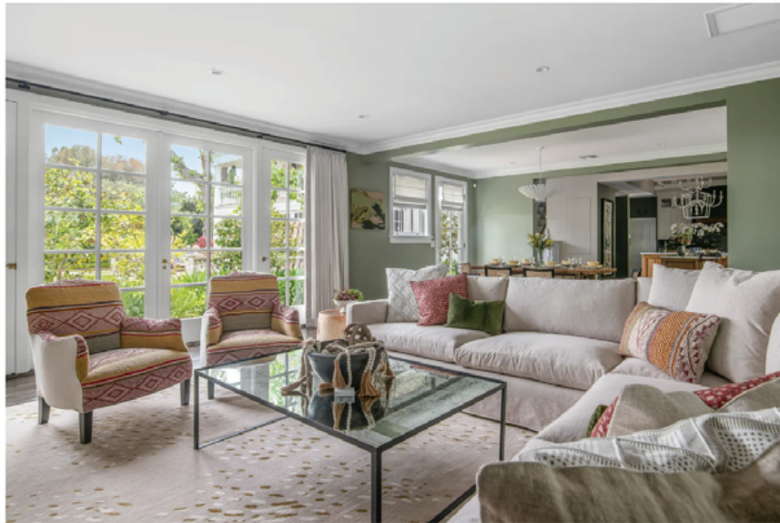
Family room by KMP Interiors