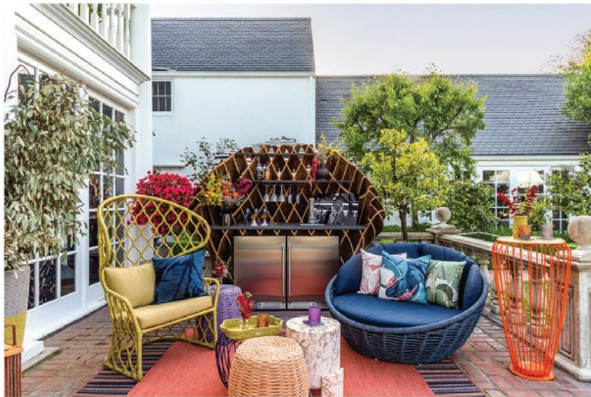
Terrace by R/terior Studio