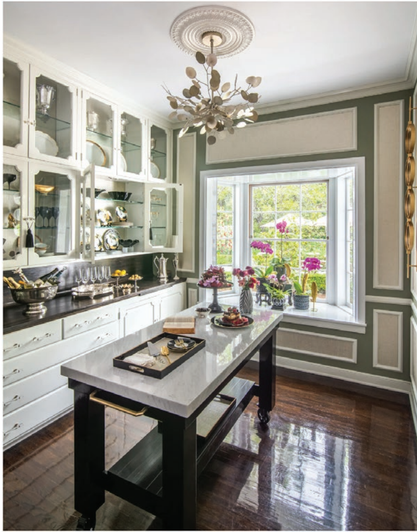
Butler's pantry by Rachel Duarte Design Studio