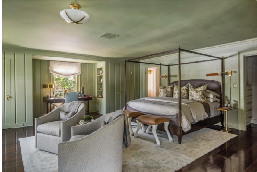
Primary bedroom by Courtney Thomas Design

A Japanese-inspired wallpaper swathes the guest bedroom, serving as a rich ground for Tocco Finale's invitingly layered, gold-toned lighting and sophisticated bed linens. In the adjoining bath, the designer opts for brushed brass Crosswater London fixtures courtesy of George's Kitchen & Bath to enrich the all-white tile interior.