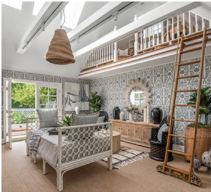
Guesthouse living room and loft by the Art of Room Design