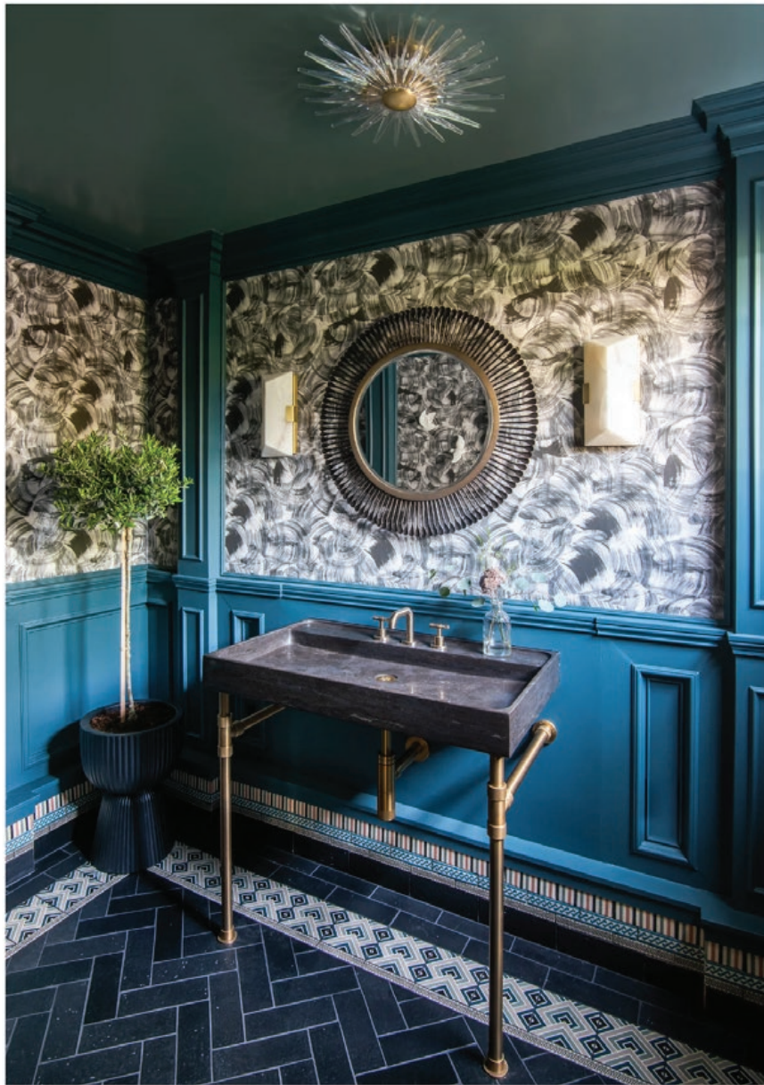
Library bath by Blue Brick Design