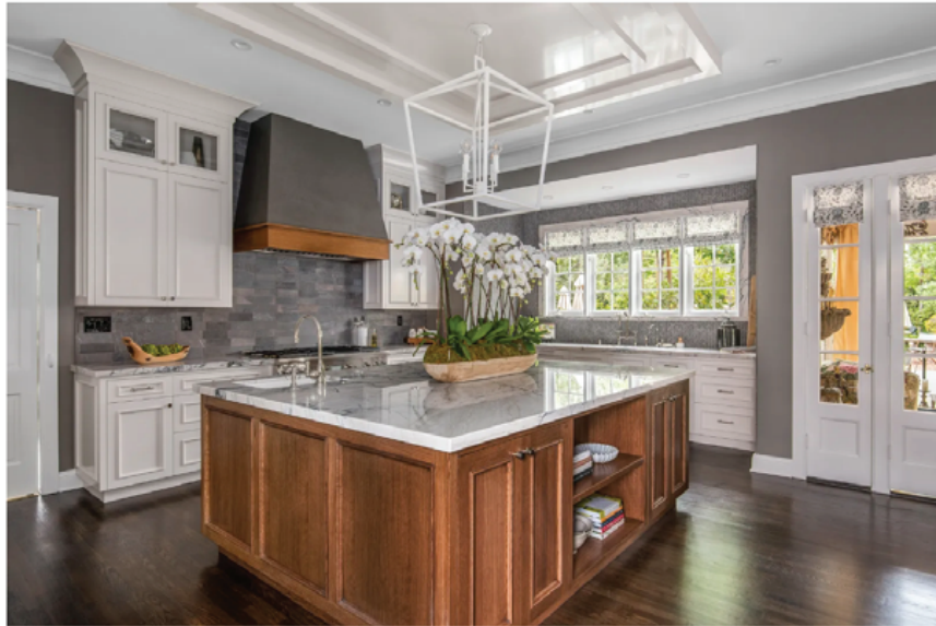
Kitchen by KMP Interiors