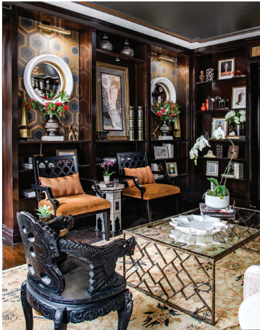
Library by Halter Home