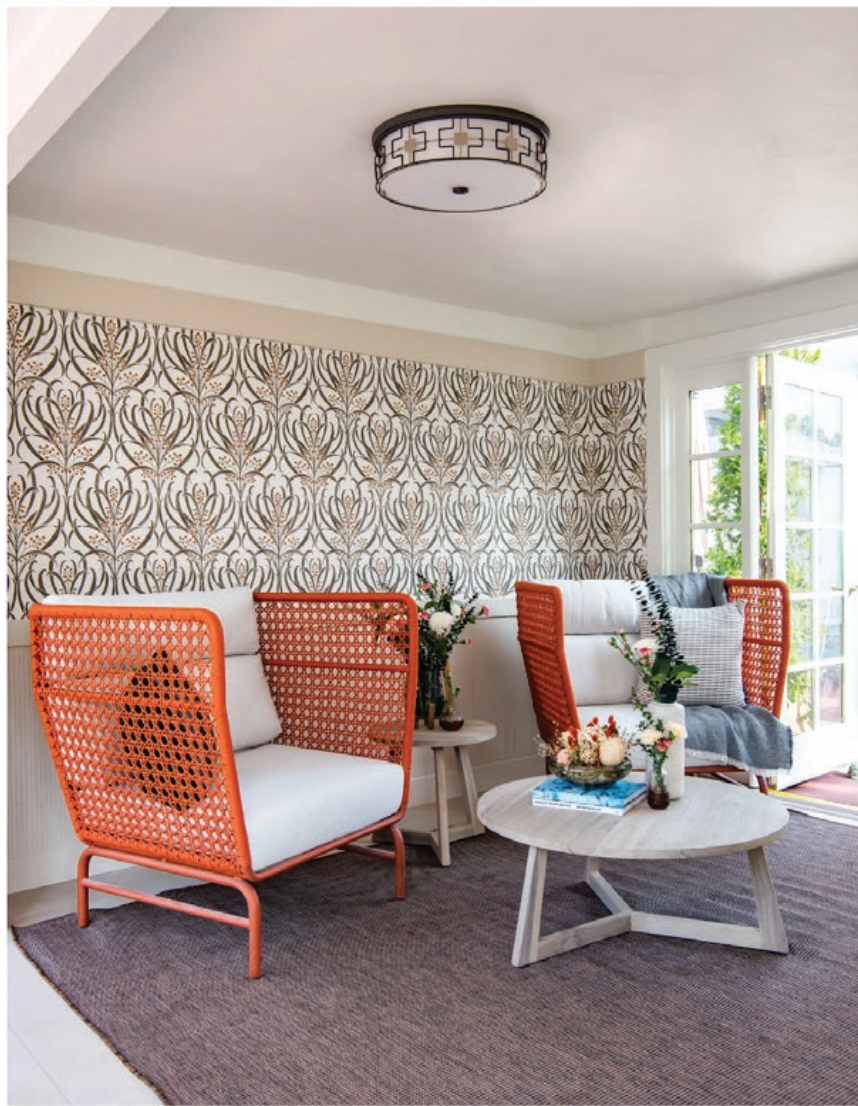
Pool cabana lounge by the Studio For