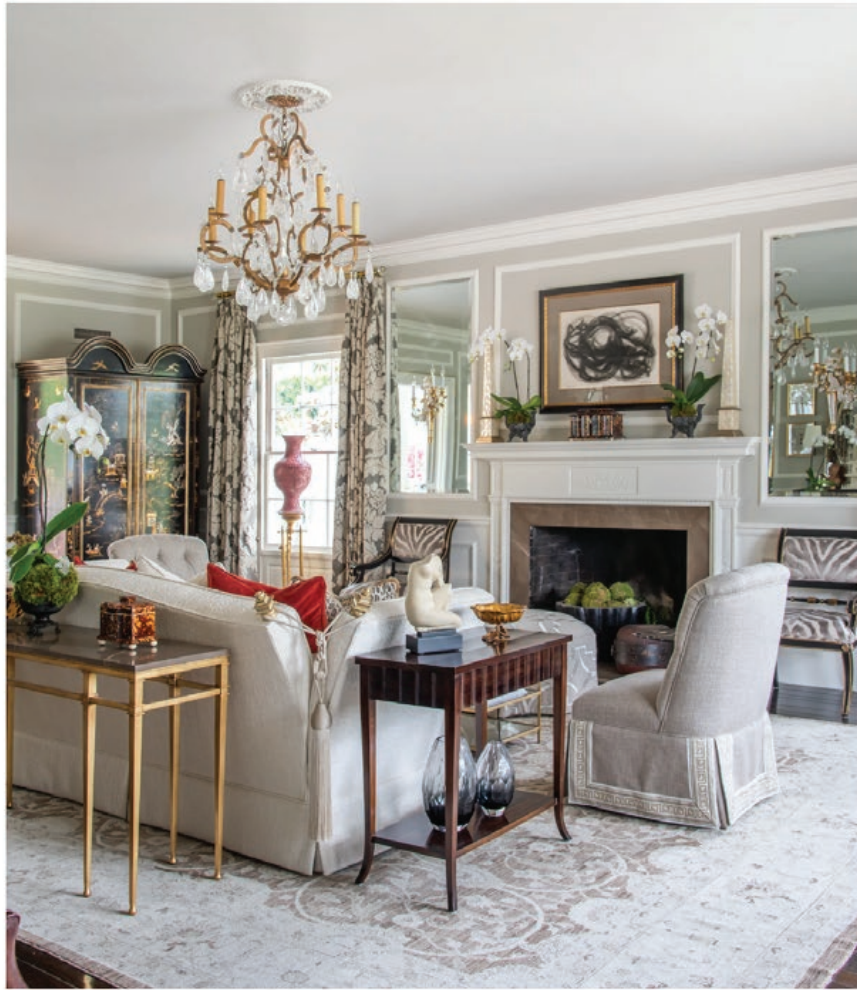
Living room by Tocco Finale