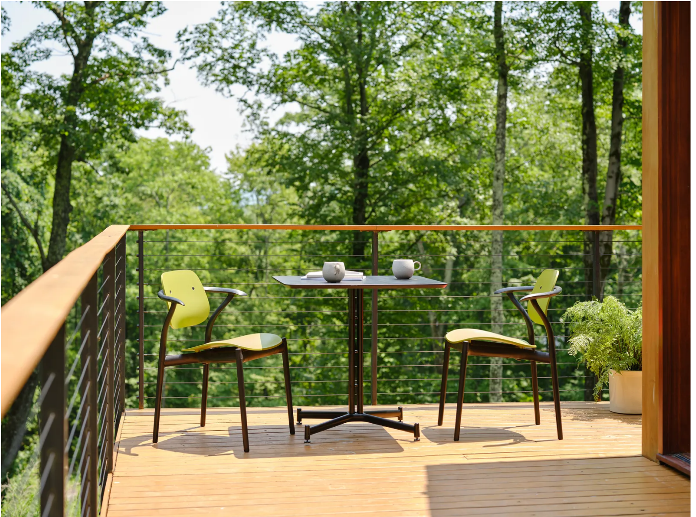
Ini Archibong's Iquo Collection for Knoll.