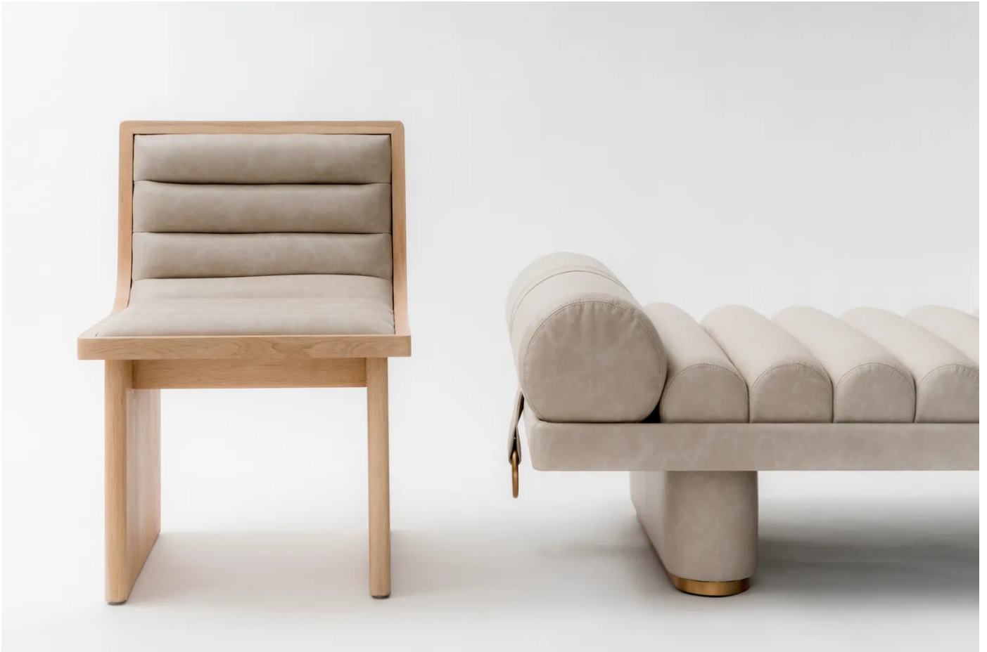
Dining chair and daybed by Workshop/APD for Colony The Principals Collection.