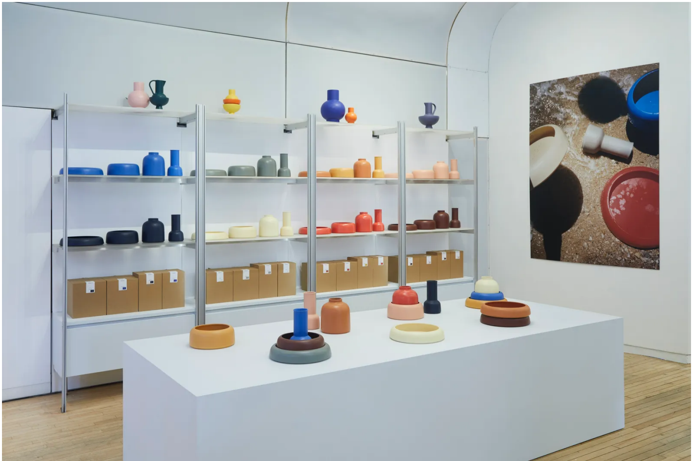
The Omar Sosa x Raawii pop-up at MoMA Design Store in New York.