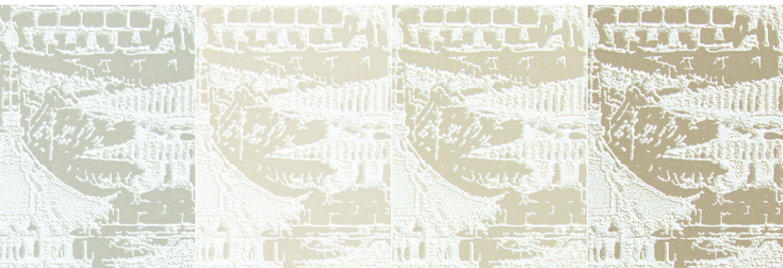
MR-SPD-1033 Engraved Gray