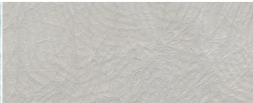
MR-YE-4033 Silver Onyx