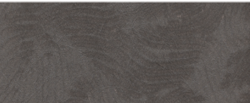
MR-YE-4176 Tahitian Pearl