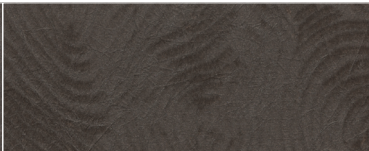
MR-YE-4113 Smoky Topaz