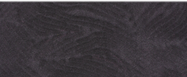
MR-YE-4407 Deep Amethyst

Momi Moonstone follows the time-honored tradition of Japanese papermaking. Pure Abaca pulp is stamped with an intricate copper plate dipped in rayon fiber. The rayon fiber reflects light and the Japanese crinkling technique, Momi, adds another layer of dimensionality and luster. Momi Moonstone is reminiscent of silk or velvet and creates a setting that harmoniously combines culture and beauty. Available in 10 tranquil colorways.