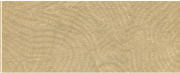
MR-YE-4160 Pale Citrine