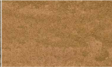
MR-W-56-X10-G Luxe Gold