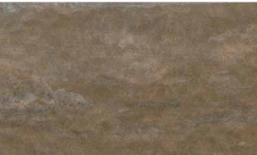
MR-W-56-034-S Gilded Pewter