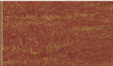
MR-W-56-245-G Luxe Red

Based upon one of Maya Romanoff's most enduring designs, Weathered Metals incorporates metallic pigments in an organic design to create a random, rhythmic pattern. Entirely hand-crafted in our Chicago studio. Custom colors and roll lengths available.