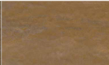
MR-W-56-035-G Gilded Bronze