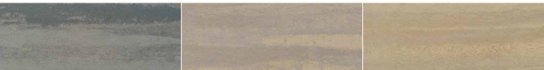
MR-FV-16506-S Blue Quartzite