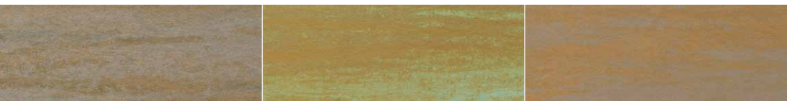
MR-FV-16034-S Gilded Pewter