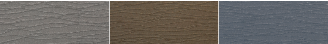
MR-YT-28-176 Tahitian Pearl