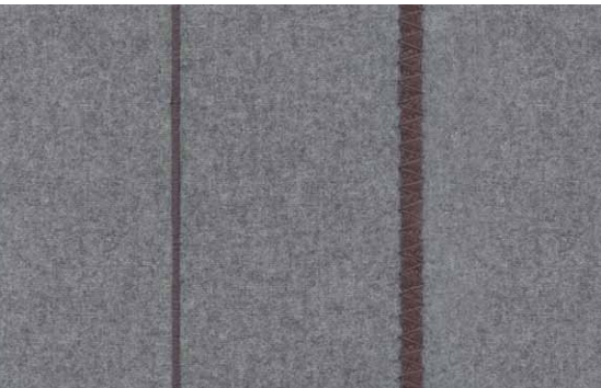
MR-BK-01-1X02 Heathered Grey/Grey