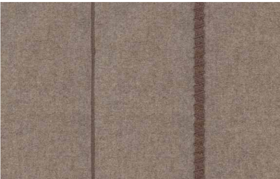
MR-BK-01-2176 Heathered Tan/Taupe