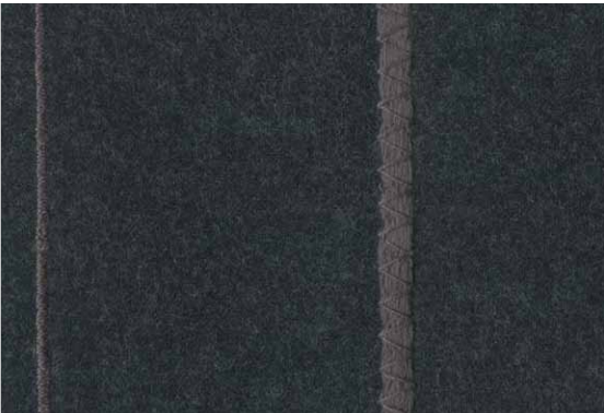
MR-BK-01-4X02 Heathered Charcoal/Grey

Designed by David Rockwell for Maya Romanoff. Blanket's felted texture handsomely pairs a warm, comfortable aesthetic with clean, tailored design. Durable, genuine wool blend fabric wallcovering is offered in two embroidery patterns, Yarn & Stitch and Zig-Zag. Treated for stain and water resistance.